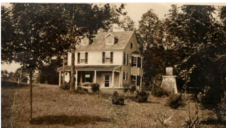
Birchland in 1940