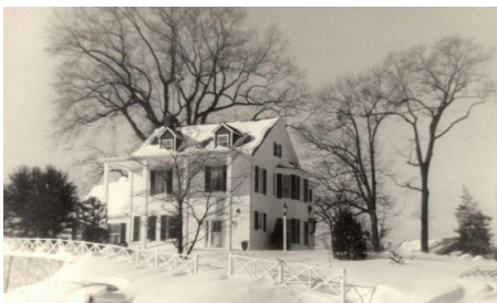
Birchland in 1920

The registration deadline to vote in the June 17 th primary is May 27 th . Same day registration is now available